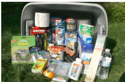
What to include in an Emergency Preparedness Kit